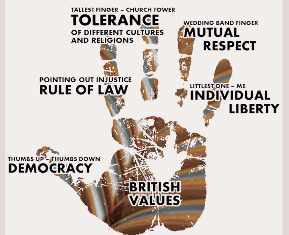
Fundamental British Values and how to remember them!

The Fundamental British Values, the school values and character education all allow our young people to grow, thrive and excel, and make Honley an exceptional place to learn and to work.